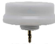
12VDC microwave occupancy sensor

This LED Linear High Bay fixture has premium quality performance and technology. Ideal for one-to-one replacements for conventional HID, T8 or T5 fixtures. The revolutionary high efficacy light output of 150 Lumens per watt will reduce overall operation costs. Primarily used as high bay lighting for commercial and industrial buildings. Standard V-hook chain mount. Pendant mount optional. Microwave motion occupancy sensor optional.