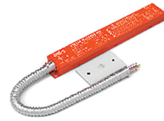
Bilda BLD-HM08D-8W Emergency backup installed in 2x4

These 2x2 and 2x4 Back-Lit LED panels are designed to deliver general ambient lighting in a variety of indoor settings including schools, offices, hospitals, stores, and are the perfect choice for both new construction and retrofits. This high-efficacy fixture is 5 CCT and power tunable as well as standard 0-10 V dimmable.