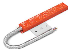
Bilda BLD-HM08D-8W and BLD-HM15D-15W Emergency backup installed in 2x2 and 2x4

These 2x2 and 2x4 Back-Lit LED panels are designed to deliver general ambient lighting in a variety of indoor settings including schools, offices, hospitals, stores, and are the perfect choice for both new construction and retrofits. This high-efficiency fixture is 5 CCT and power tunable as well as standard 0-10 V dimmable.